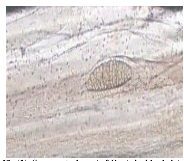
Fig.(1): Sarcocystosis cyst of Goats inside skeletal muscle by Trichinoscopy technique ( X 10).